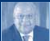
Minister Pravin Gordhan Department of National Treasury Republic of South Africa