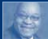
The Honorable Dr. Jacob Zuma President Republic of South Africa