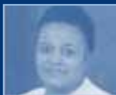
Minister Edna Molewa Department of Water & Environmental Affairs Republic of South Africa