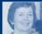
Mary Robinson Chairwoman Mary Robinson Foundation - Climate Justice