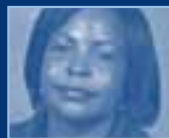
Minister Maite Nkoana-Mashabane Presiding President of COP17 Republic of South Africa