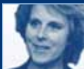
Connie Hedegaard Commissioner for Climate Action EU Commission