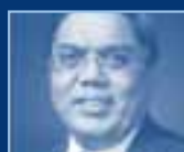
Tulusi Tansi Chairman Suzlon