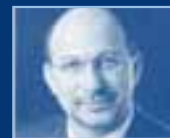
Minister Trevor Manuel The Presidency: National Planning Commission Republic of South Africa