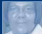
Minister Dipuo Peters Department of Energy Republic of South Africa