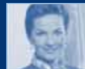
Christiana Figueres Executive Secretary UNFCCC